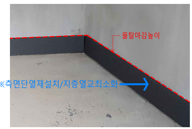
※측면 열교차단 단열재설치